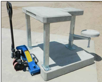
EASILY MOVABLE WITH A PALLET JACK