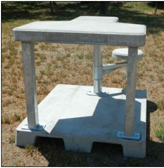
SHOOTING BENCH INSTALLED ON PAD